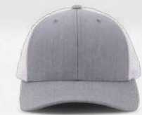
HEATHER GREY/ WHITE